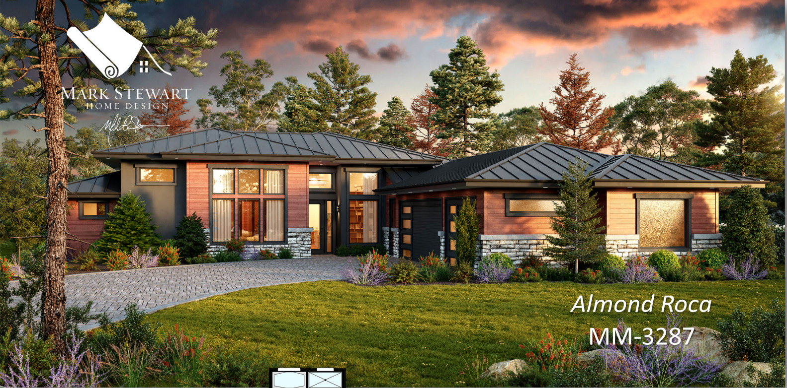
Almond Roca MM-3287