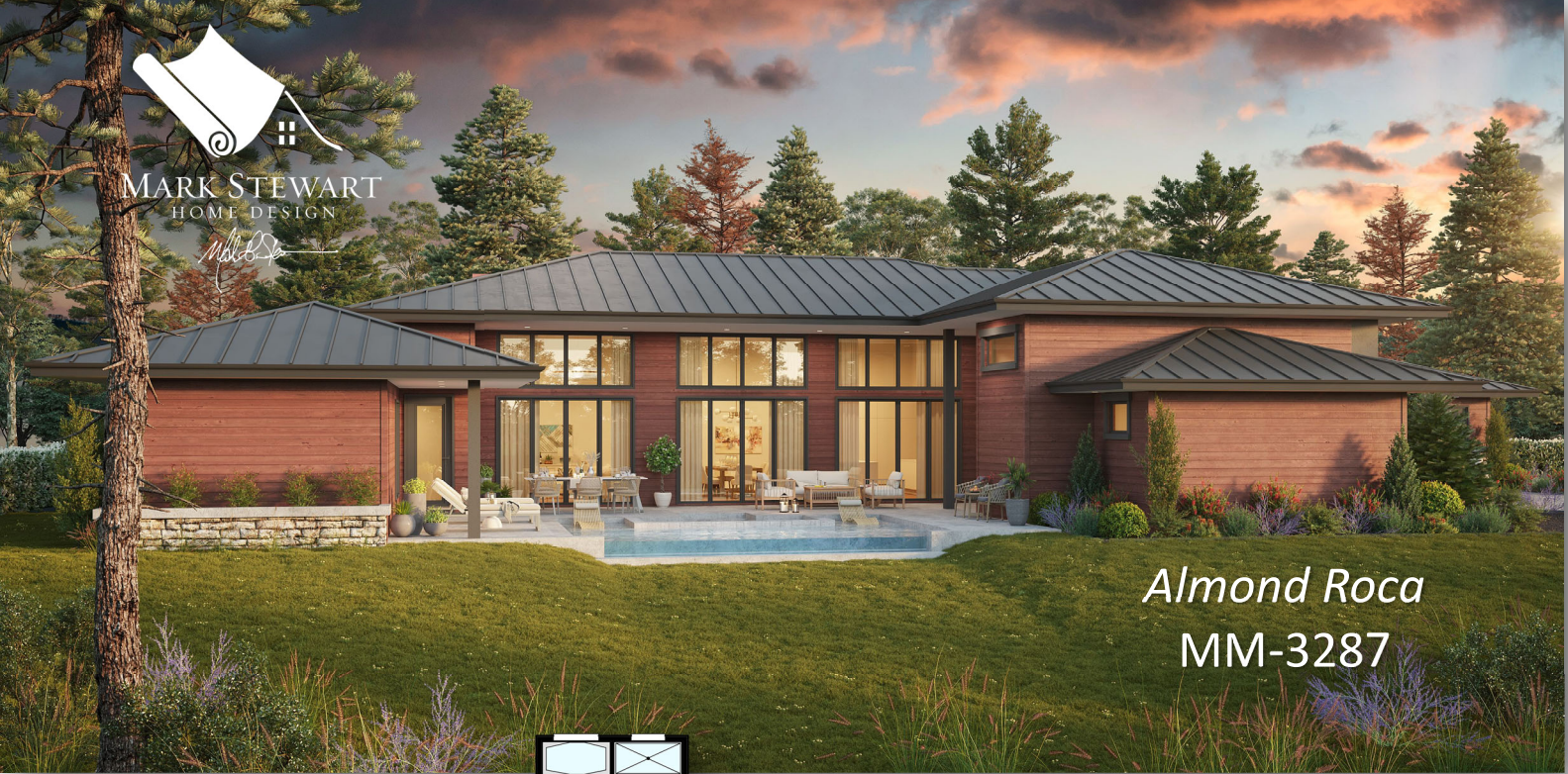
Almond Roca MM-3287