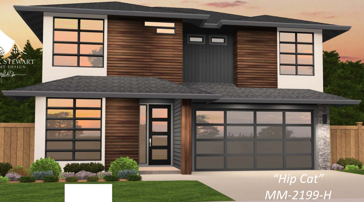
"Hip Cat" MM-2199-H